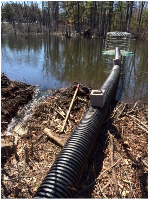
Pond Leveler Being Installed, Rangeway Rd.