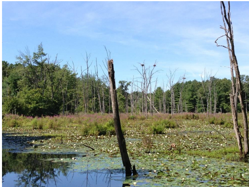
Billerica Beaver Created Heron Rookery

The use of flow devices at 43 sites in town has prevented the trapping of 38 beaver colonies. In Billerica these 38 beaver colonies create an average of 10 wetland acres with their dams, or 380 total wetland acres that would not exist if the beavers were trapped. Estimates vary but ecological value of freshwater wetlands can conservatively be valued at over $5,000 per acre per year. 4 Therefore the untrapped beavers are providing the town with approximately $2,000,000 of free ecological services every year, and over 35 million dollars in ecological services since the inception of the program.