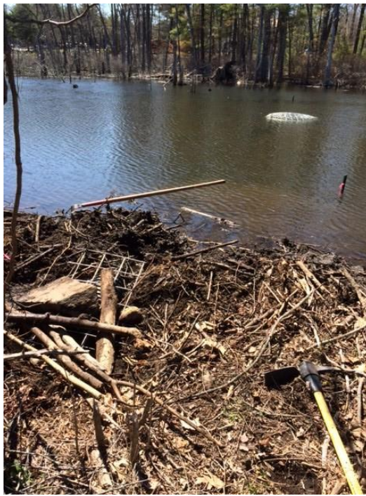
Pond Leveler in Beaver Dam, Rangeway Rd.